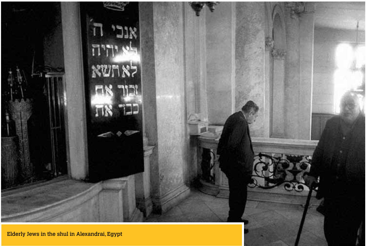
Elderly Jews in the shul in Alexandria, Egypt