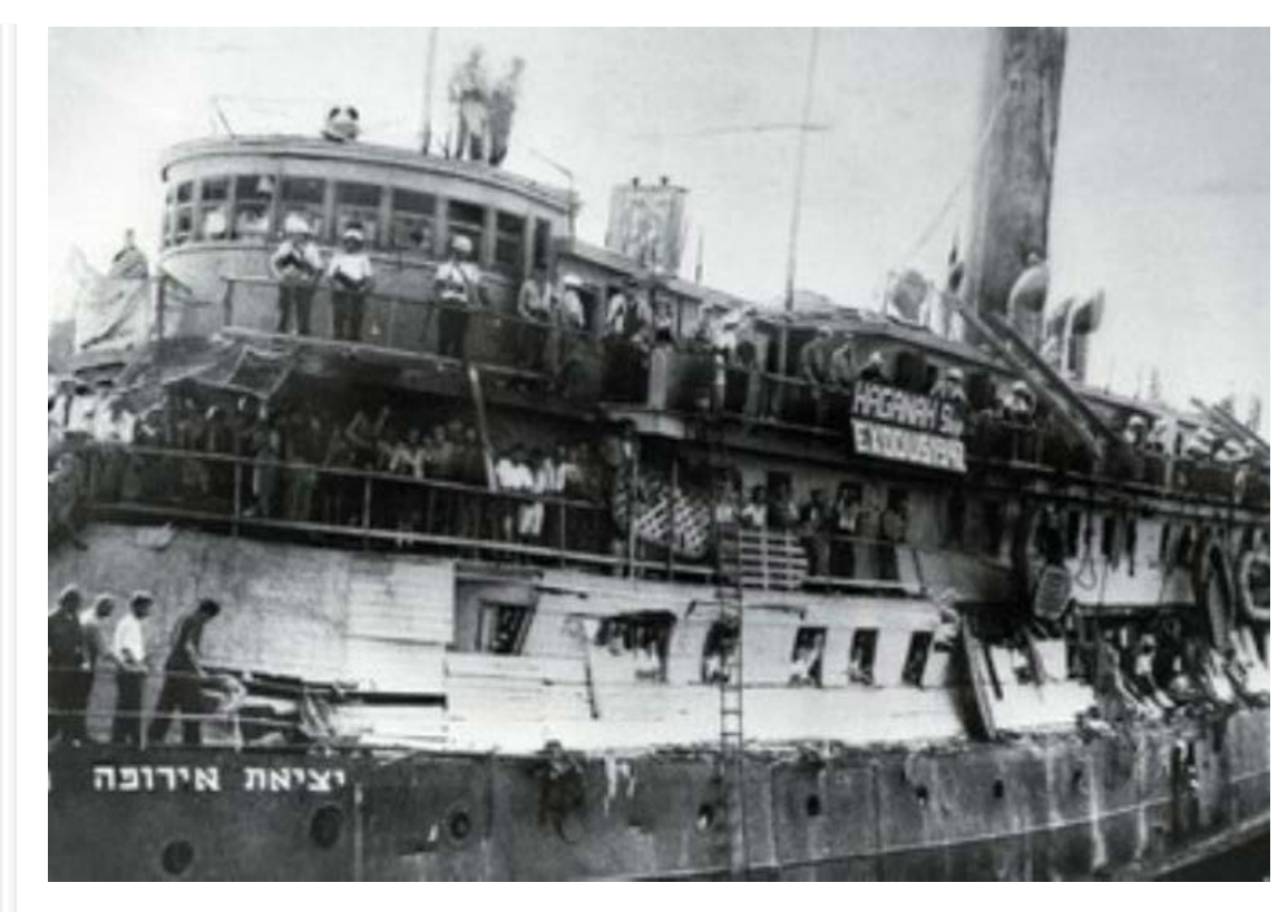
Jewish refugees arrive in Palestine 390.

S ome 1.7 million documents – purportedly containing details about the assets of Egyptian Jews in the 1940s, 50s and 60s – were seized by Egyptian security services in recent days just before they were exported to Israel, according to several online newspapers.