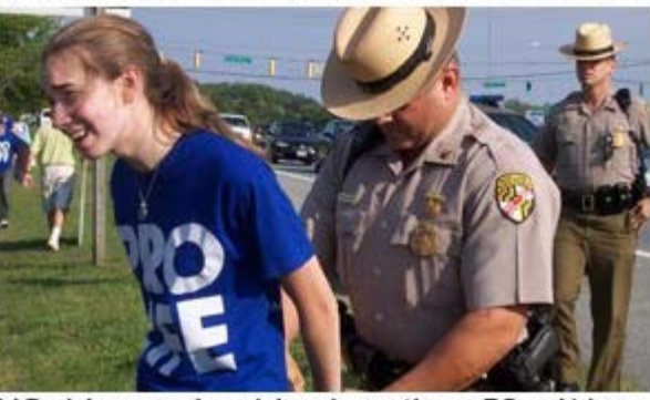
US drivers who drive less than 50 mi/day are in for a big surprise.. dailyfinancereport.org [continued here]

A report in the Egyptian government- owned Al-Ahram daily newspaper holds that the "Jewish documents," packed in 13 cartons, were confiscated by Egyptian authorities ahead of them being "smuggled" out of the country from Jordan.