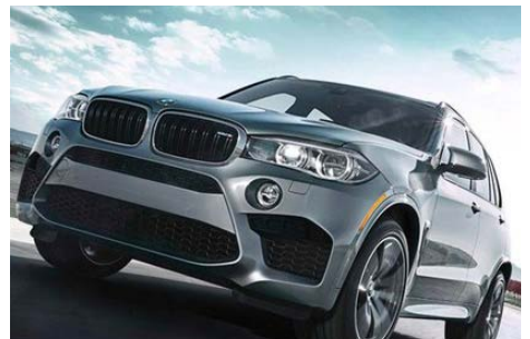
Find the Best Price for Your Dream BMW X5