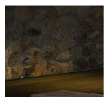
Shapira: Restitution only 15% of assets to