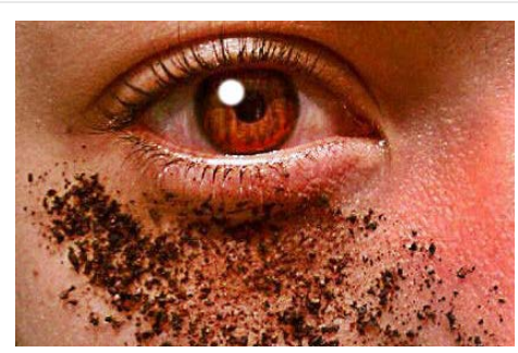
(1) Easy Trick "Removes" Your Eyebags & Wrinkles (Do This Tonight!)