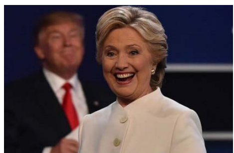
A 32-year-old Jewish billionaire tops Clinton donor roll