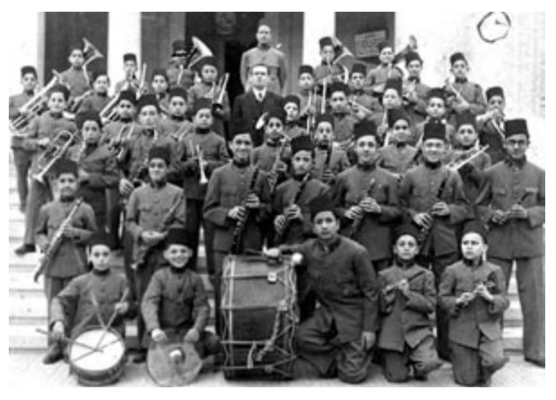
egypt metro feat 88 298.

Today Jews recount the miraculous exodus from Egypt. In Israel, thousands of Egyptian-born Jews, recall their expulsion from that country during the last century.