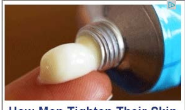
How Men Tighten Their Skin

By BATSHEVA POMERANTZ \ 03/28/2007 09:21 X