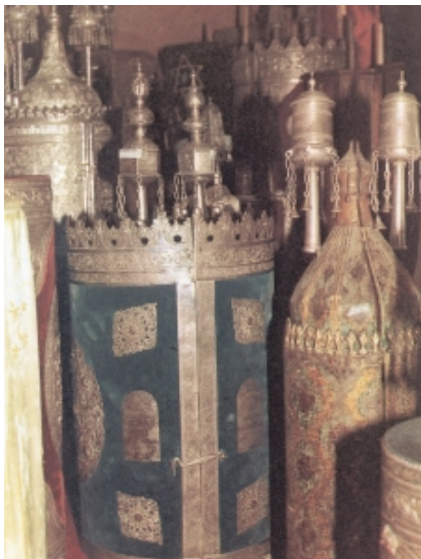
Torah scrolls in the Ark of the Eliahu Hanabi Synagogue in Alexandria. The silver-plated scroll at the back was used only in the Kol Nidre service on Yom Kippur.

Many informants insisted that swearing was a reprehensible habit and that they themselves refrained from pronouncing oaths. However, oaths are very common in the language of the Jews. Most consist of Hebrew components combined with Arabic oath formulas. The most commonly used oath formula is we (also wu , wa : by ..., by the life of ..., I swear by ...). Other formulas include wehyāt ... (by the life of ..., I swear by the life of ...), and be , similar to we .