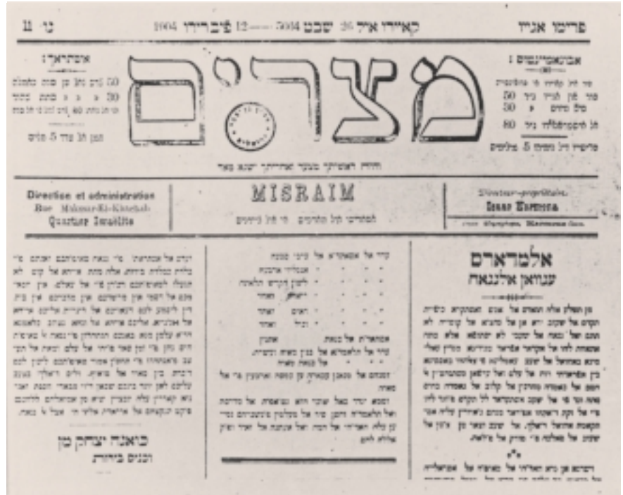
The Judeo-Arabic newspaper Misraim .

Jews who go to the synagogue at the end of the Sabbath receive myrtle branches. They rub the leaves in their hands and recite the blessing borē 'ašēy besamīm (lit.: [Blessed art Thou Lord, king of the universe], who created sweet-smelling trees). Myrtle in Arabic is marsīn , which some Jews pronounce marsīm , but