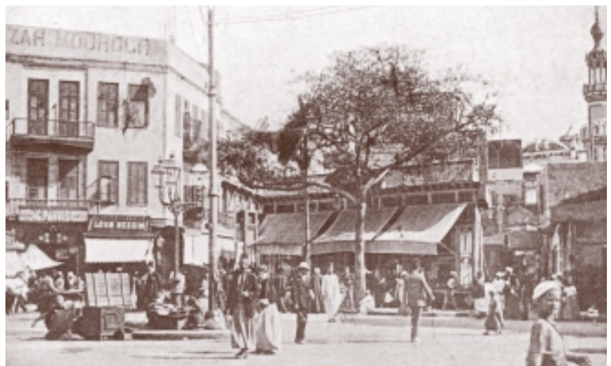
Entrance to the Jewish Quarter of Cairo. The old Jewish Quarter is part of the Mousky quarter, a commercial neighborhood that was populated mostly by Jews.

In many Jewish communities, in the East as well as in the West, elements of the unique Jewish vocabulary served as a secret language, making it possible to communicate in the presence of non-Jews without the latter understanding what