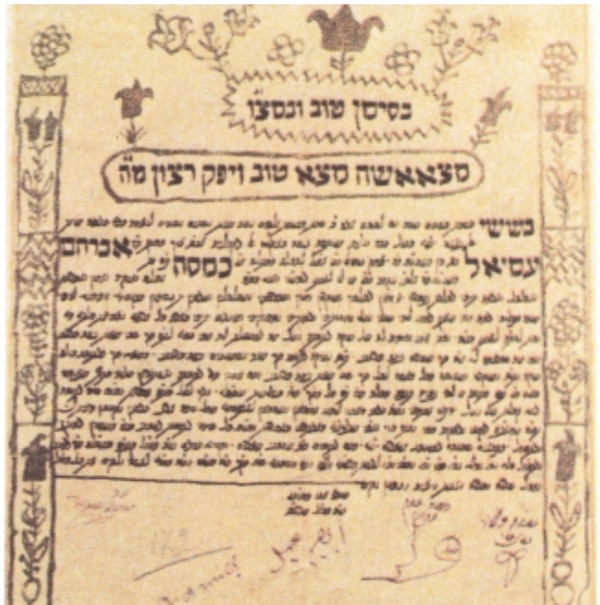
A marriage contract from Mit-Ghamr (1903), decorated with motifs from Egyptian folklore.

A unique feature of Jewish Arabic is the use of the vowel u even in cases where the standard dialect has no such form, but uses e (or i ) exclusively. Examples include mušṭ (comb), versus standard mešṭ ; ṭušt (tub or washtub), versus standard tešt ; and muḥadda (pillow), versus standard meḥadda . Even some words of Hebrew origin have Jewish Arabic versions substituting u for the original vowel: kutubbā (marriage contract), as opposed to ketubbā ; or kuppūr ([Yom] Kippur), as opposed to kippūr .