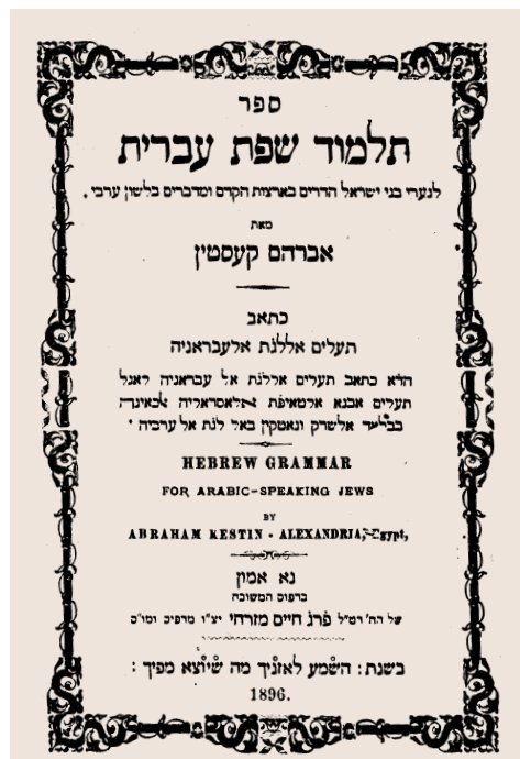
A Hebrew grammar book designated for the Arabic-speaking Jewish pupils of Alexandria.

The verb 'etdardem or 'eddardem (fell asleep) is also commonly used in the imperative by impatient or angry parents to their children at bedtime: "Go to sleep! Fall asleep!" 18 Many speakers consider it a profanity. The verb dardem exists in Egyptian Arabic, where, as a secondary form of radam , it means "cover, fill [mainly with earth]." Etdardem is its passive form, 19 but neither form is widespread. In Jewish Arabic, 'etdardem , apparently influenced by the Hebrew root RDM and the verb nirdam (fell asleep), is used only with the meaning of "fall asleep." The verb, which looks as if it were