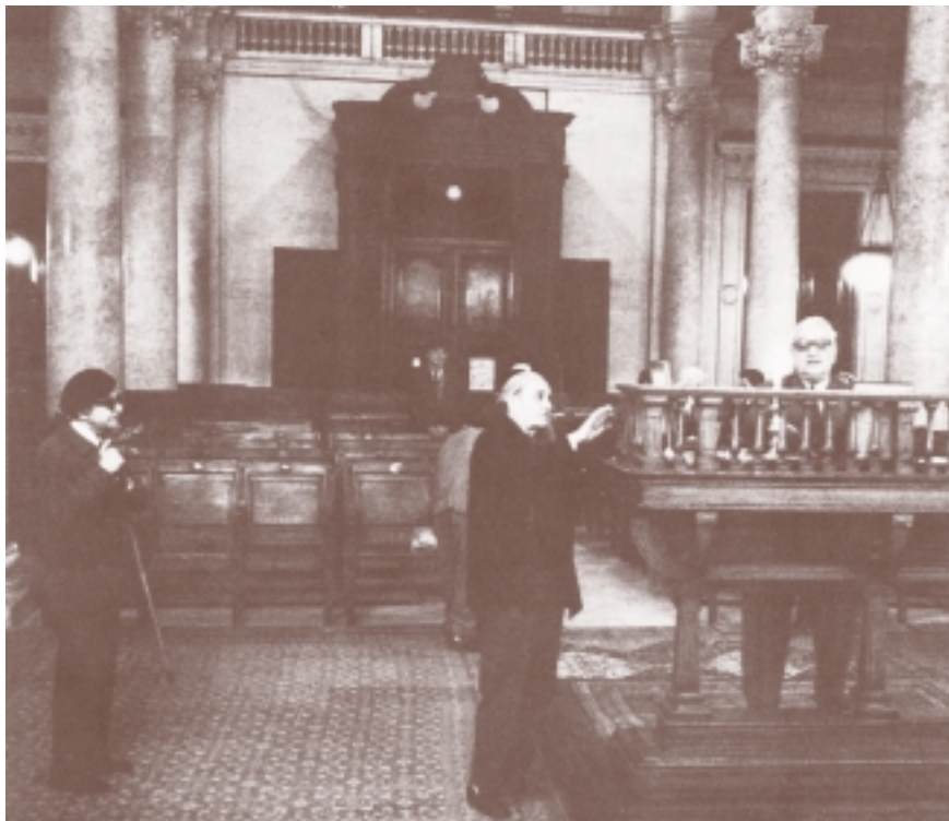
Conclusion of the Sabbath ( Habdālā ) ceremony in the Eliahu Hanabi Synagogue in Alexandria (1980).

many pronounce it barsīm , which in Egyptian Arabic denotes a species of clover used as animal feed. Some of my informants told me that they wondered how the same word could refer both to animal feed and to a plant rubbed for its sweet smell at the end of the Sabbath.