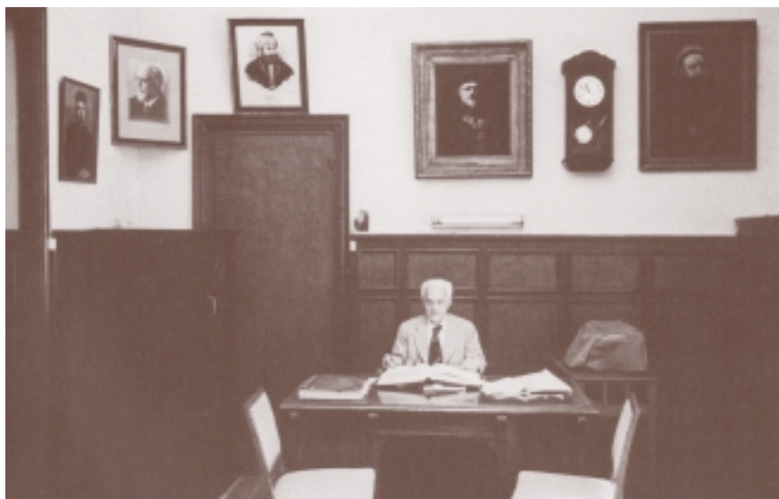
The Chancellor of the Alexandria Jewish community in his office.

The word el-kumminutē or el-komminutā (the first derived from French communauté , the second probably from Italian comunità , with the addition of the definite article) is commonly used to designate the central organ of the Jewish