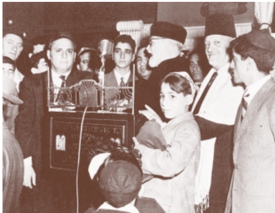
Bar mitzvah ceremony in Cairo (1953).

Tefillā (prayer); gelyān 20 (raising the Torah scroll in the synagogue); tagleyya (carrying the Torah scroll around the synagogue); šammāš (caretaker, beadle of a synagogue; also, the ninth candle from which the Hanukkah lamp is lit); ḥazzān (cantor); gabbāy (administrator of a synagogue); tebbā (prayer rostrum); sēfer , pl. sefarim (Torah scroll).