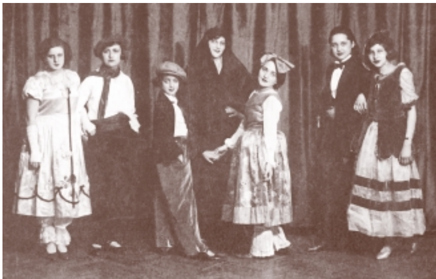
Purim play staged by Jewish schoolgirls in Cairo.

In the plural, the Hebrew form is usually retained, as in mamzerīm (bastards) or mitsvōt (religious commandments), but the Arabic plural suffix īn is occasionally attested, as in mamzerīn .