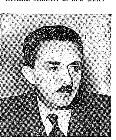
Moshe Shertok, spokesman at the U. N. and Foreign Minister