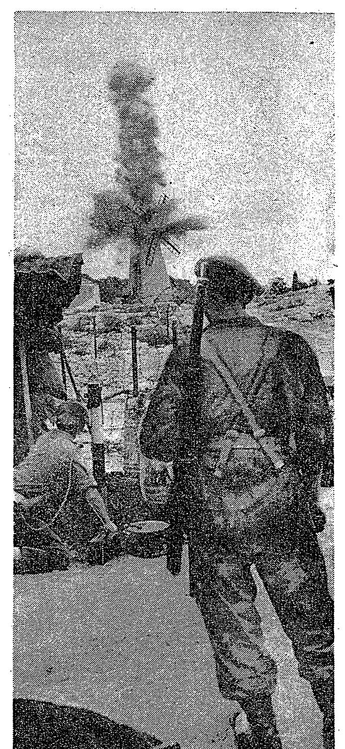
British engineers destroy a windmill in Jerusalem, which they said Haganah troops had been using as a pillbox.