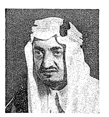
Emir Faisal al-Saud. Foreigr Minister of Saudi Arabia