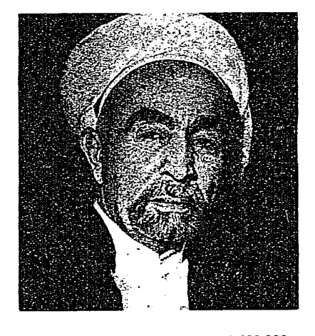
King Abdullah, head of a nation of 400,000 and a potent voice in all Arab League affairs.

I turned to the chamberlain. He told me that the im- (Continued on Page 61)