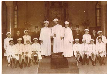
Egyptian Alexandria Jewish choir at Samuel Menashe Synagogue

out of Egypt. According to Deputy Foreign Minister Danny Ayalon, "We have this great pool here of testimonies of the survivors who are still alive. All of this information about blocking the documents has no basis, because we have all the information here with us. With all due respect to whether these documents exist or not, we have enough historical information and testimonies right there," the Jerusalem Post reported. Ayalon has been actively involved in raising public awareness about the issue of Jewish refugees from Arab countries via his facebook campaign page "I am a refugee."