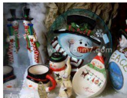
Santa Claus and Christmas trees decorate shops and streets of Cairo