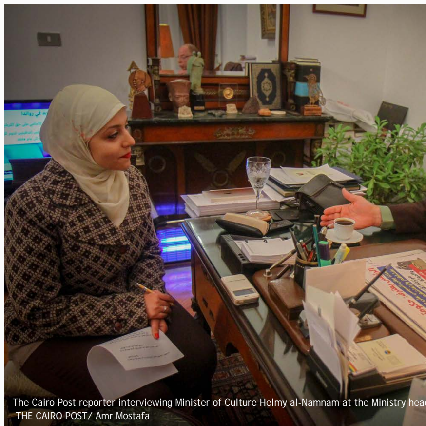
The Cairo Post reporter interviewing Minister of Culture Helmy al-Nammam at the Ministry head

"It [the library] has a zero experience in digitizing," he continued, adding that the ENLA's project of digitizing has being conducted.