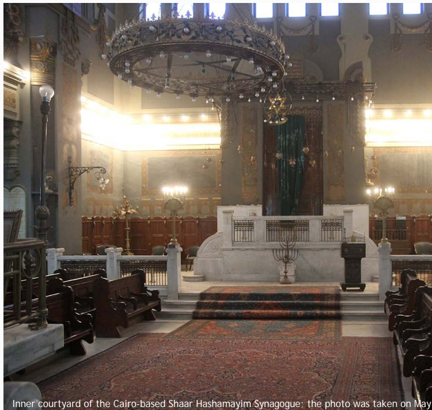
Inner courtyard of the Cairo-based Shaar Hashamayim Synagogue; the photo was taken on May