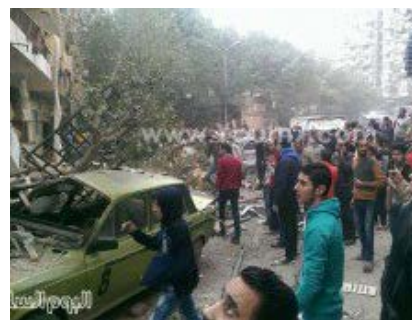
Impact of explosion in Faisal, Giza