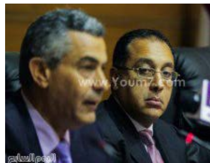
International conference to assess the safety of roads and bridges launches

"I have no financial resources to open the libraries or even catalogue these books; there should be a librarian specialized in indexing. Unfortunately, these Judaic books exist in moist places and are at