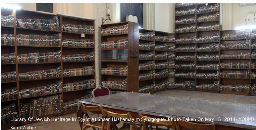
Library Of Jewish Heritage In Egypt At Shaar Hashamayim Synagogue - Photo Taken On May 15, 2014