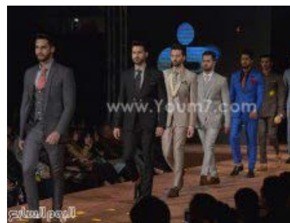
Men's Fashion Week ends in Karachi, Pakistan