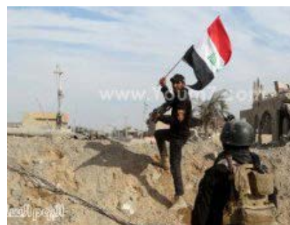
Iraqi army declares first major victory over Islamic State in Ramadi