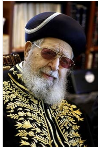
The late rabbi Ovadia Yosef, the most important Mizrahi religious figure of the last century.

To anyone convinced that Israel’s war with its neighbors will end in a reasonable compromise, such stubbornness must seem lamentable. If, however, one understands the conflict as a test of wills that will go on indefinitely, and in which Israelis are