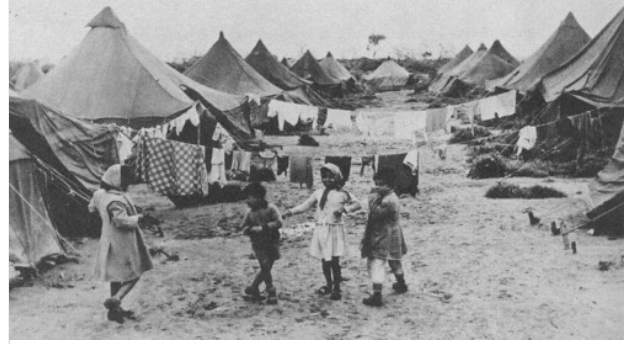
A transit camp (maabarah) for Mizrahi immigrant refugees in 1952.

Aesthetically, many of the videos are not especially different from what one sees on Arabic music channels elsewhere in the region. Most of the songs are about romantic love, of course, but in this genre it is wholly permissible to devote earnest love songs to