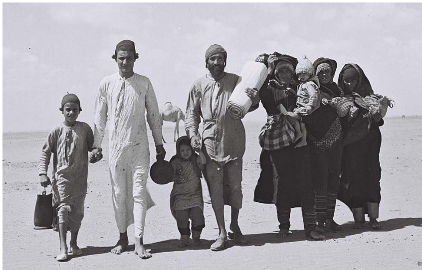
Yemenite Jews walking to Aden, the site of a transit camp, ahead of their emigration to Israel in 1949.

20 Comments | Print | E-mail | Kindle | Tweet 80