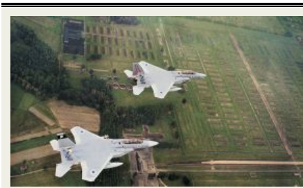
The Israel Air Force flyover at Auschwitz: A crass, superficial display

Why the Americans could not have bombed the death camp until July 1944, and why the 2003 fly ov er there was a mistake. A response to Ari Shavit.