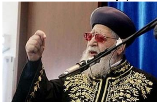
Rabbi Ovadia Yosef

Yosef reached out to a large segment of Sephardi Israelis whose observance was not rigidly Orthodox